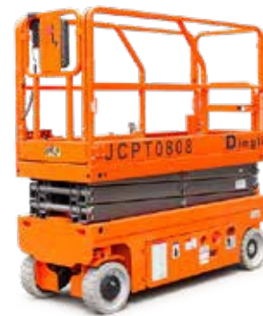
JCPT 0808 DC

Lifting capacity: Max 230 kg Working height: 7.80 mtr Height (stowed): 2.18 (1.84) mtr Lenght x width: 1.86 x 0.76 mtr Weight: 1.415 kg (4x6 v)