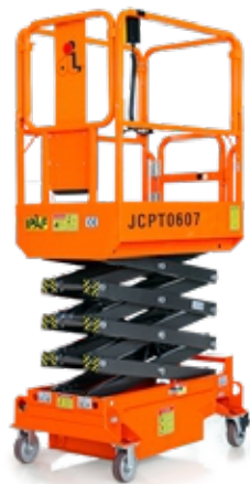
JCPT 0607 manual

The scissor lifts from Dingli/Magni are equipped with an innovative electric motor drive. Whether you are looking for a bigger model for construction, an electric scissor lift for facade work or a compact self-propelled electric scissor lift for a theater? Dingli/Magni offers high-quality scissor lifts that meet your needs. The machines have a large capacity, are reliable and easy and safe to use.