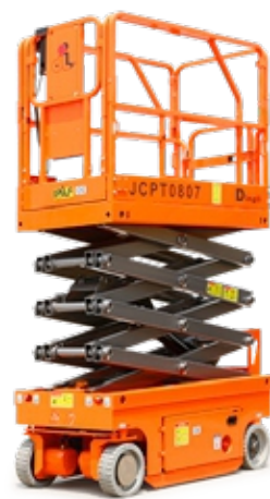
JCPT 0807 DC

Lifting capacity: Max 240 kg Working height: 5.60 mtr Height (stowed): 2.03 (1.67) mtr Lenght x width: 1.44 x 0.76 mtr Weight: 880 kg (2x12 v)