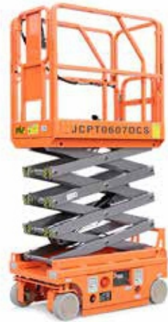
JCPT 0607 DCS

Lifting capacity: Max 240 kg Working height: 5.90 mtr Height (stowed): 1.92 (1.52) mtr Lenght x width: 1.30 x 0.76 mtr Weight: 436 kg (1x12 v)