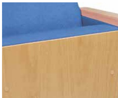
Seat with a lacquered cover.