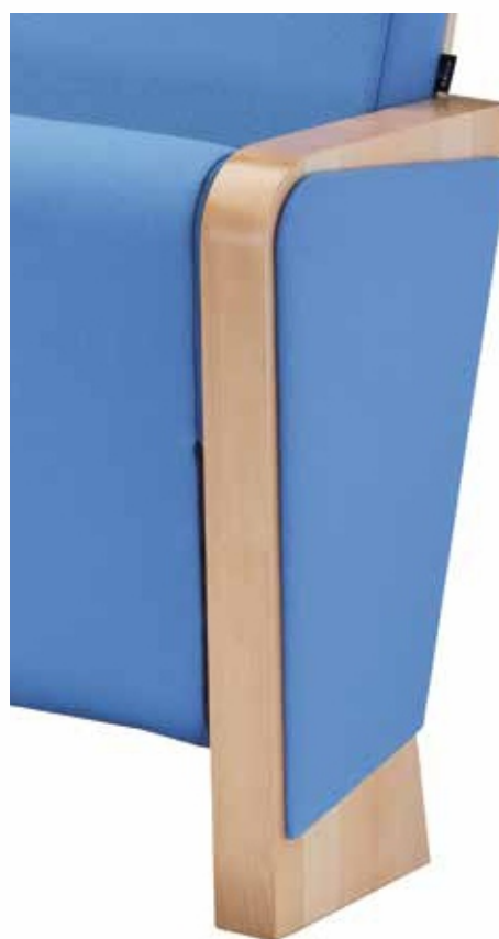
Side with upholstered panels.