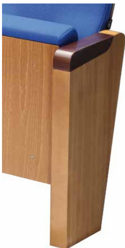
Side with an armrest in a different color.