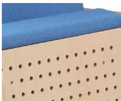
Seat with a perforated cover.