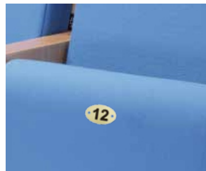
Seat and row numbering in the form of plates or computer embroidery at any position.